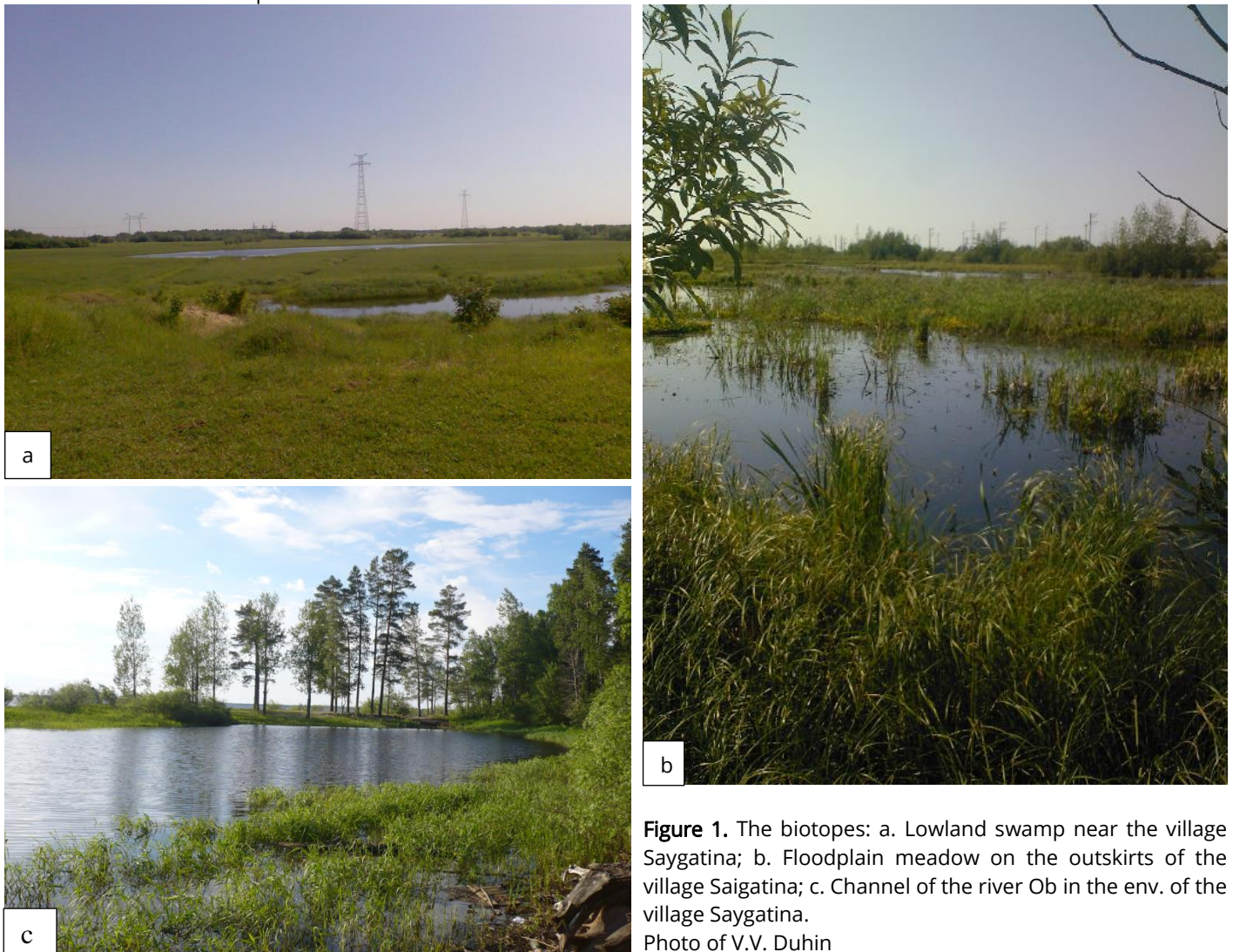
Figure 1. The biotopes: a. Lowland swamp near the village Saygatina; b. Floodplain meadow on the outskirts of the village Saigatina; c. Channel of the river Ob in the env. of the village Saygatina. Photo of V.V. Duhin

The results of collecting larvae are presented in Table 1.